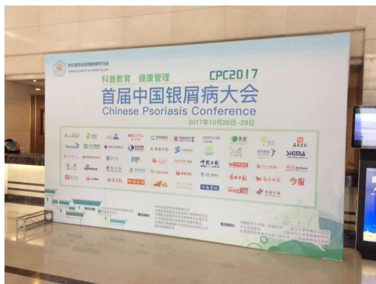
Caption: Scene picture of 1 st Chinese Psoriasis Congress (CPC2017)