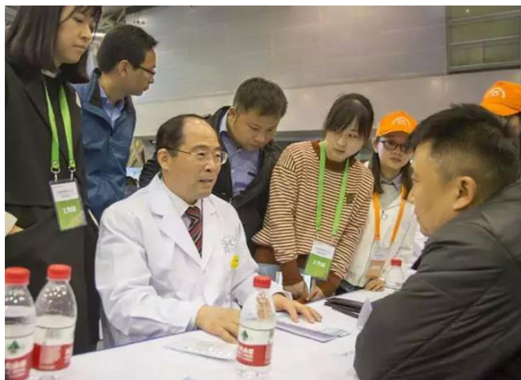
Caption: Scene picture of 1 st Chinese Psoriasis Congress (CPC2017)