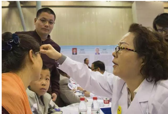
Caption: Scene picture of 1 st Chinese Psoriasis Congress (CPC2017) “Chinese Dermatology Hundred Psoriasis Experts Face-to-Face Public Welfare Activities”