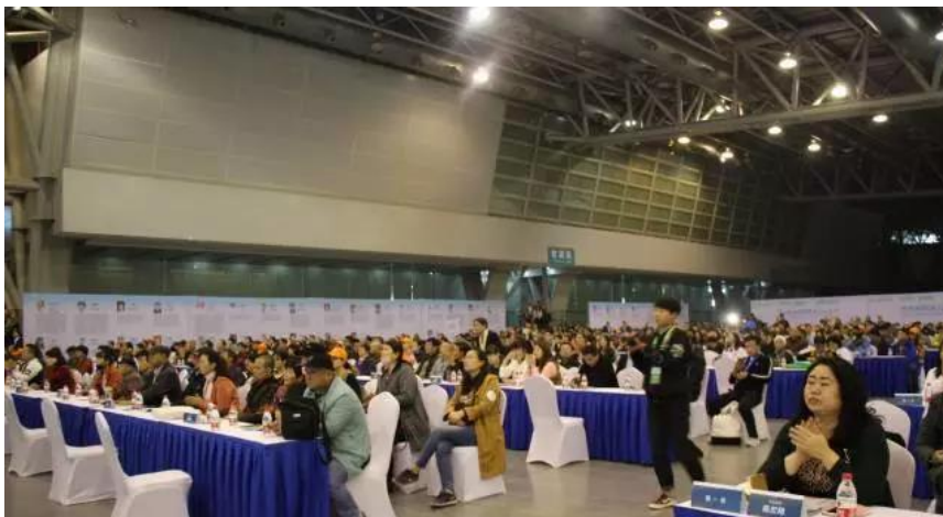
Caption: Scene picture of 1 st Chinese Psoriasis Congress (CPC2017)