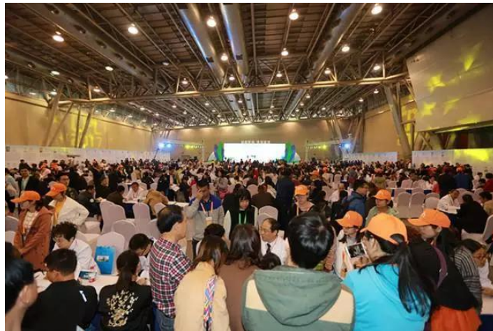
Caption: Scene picture of 1 st Chinese Psoriasis Congress (CPC2017) “Chinese Dermatology Hundred Psoriasis Experts Face-to-Face Public Welfare Activities”

Representative of psoriasis patient organization is delivering a speech.