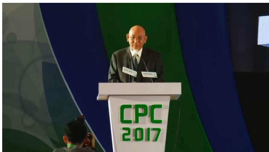
Caption: Scene picture of 1 st Chinese Psoriasis Congress (CPC2017)