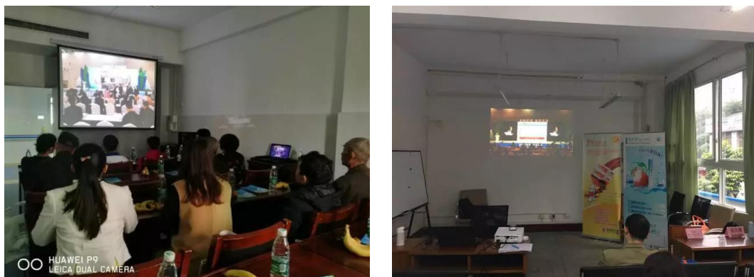
Caption: Scene picture of 1 st Chinese Psoriasis Congress (CPC2017) Psoriasis patients are watching webcast