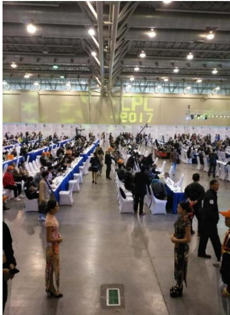
Caption: Scene picture of 1 st Chinese Psoriasis Congress (CPC2017)